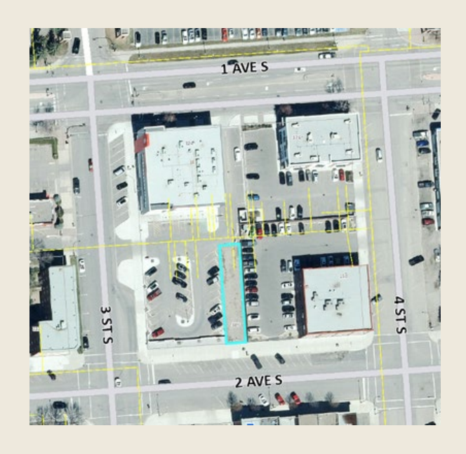
Aerial map of site boundaries (light blue) and gas lines (yellow lines)