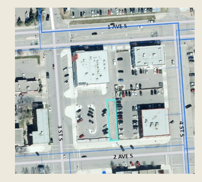
Aerial map of water lines (dark blue)